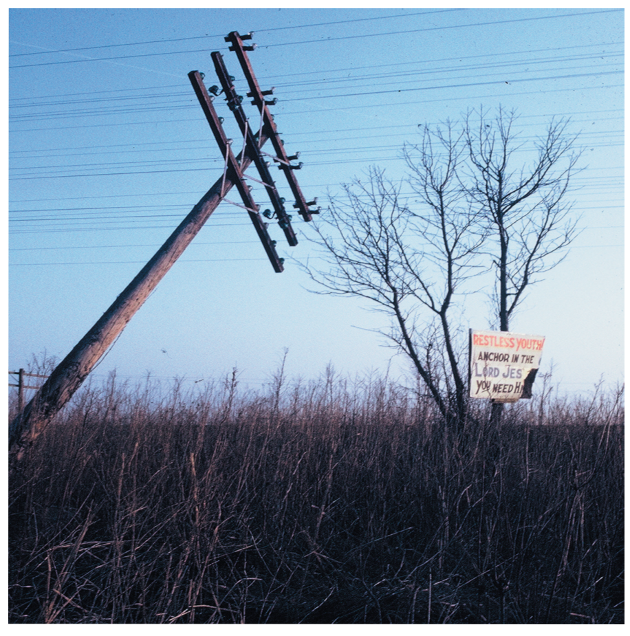
Leaving Tallulah, near Tallulah, LA

real and effective. I'm guessing that this transition is what my own sense of guidance is leading me toward, as I find myself retreating from my self-appointed role as a spiritual reporter.