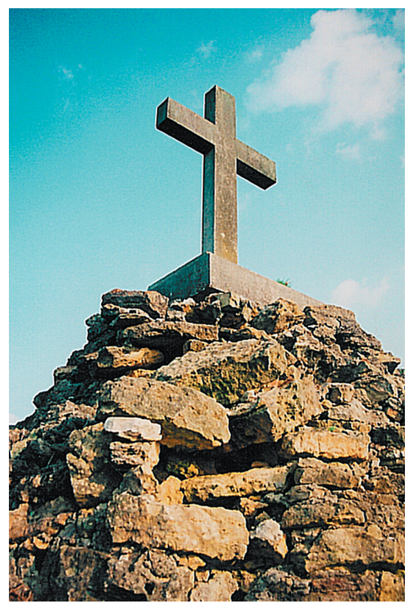
Gethsemani Monastery Cross in Trappist, KY.

There is no place on earth like the Heavens