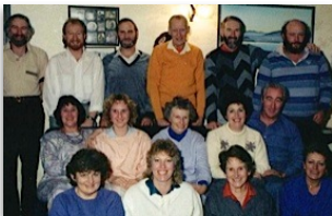
New Zealand Teaching Mission Group